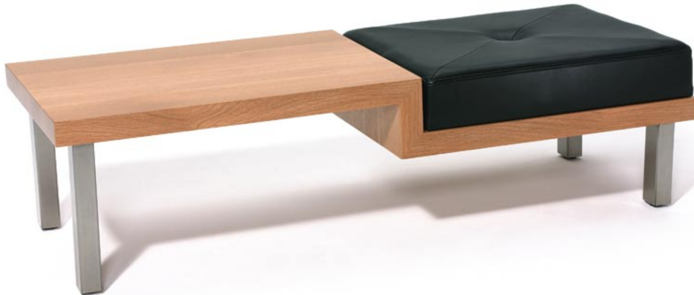
riff white oak