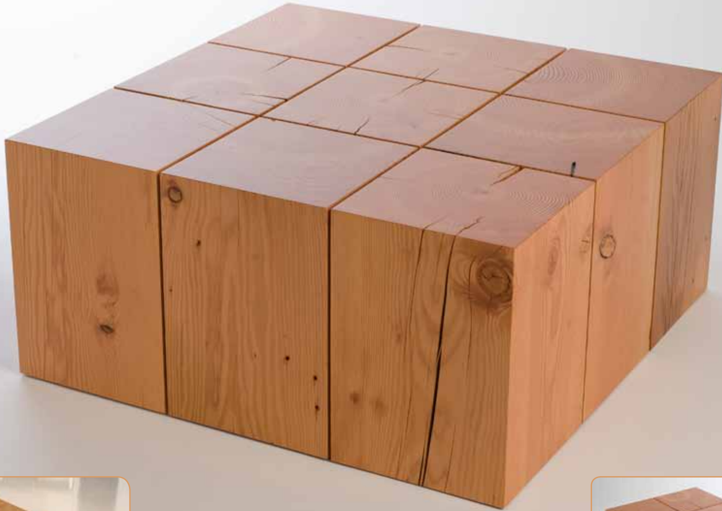
3 x 3 table