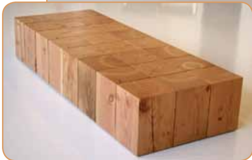
3 x 8 block table