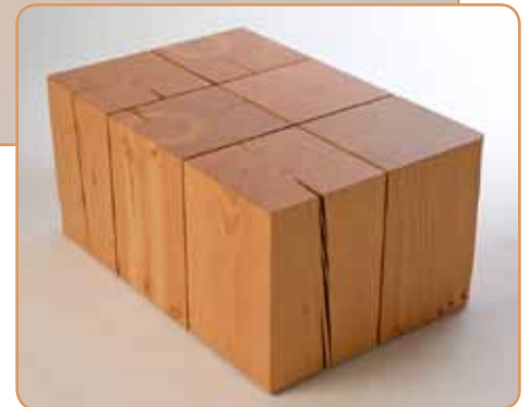
2 x 3 table